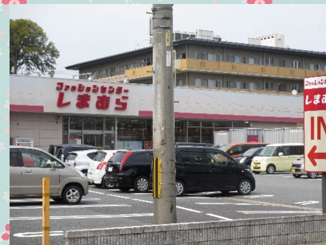
Shops that sell clothes, shoes, mattresses etc.