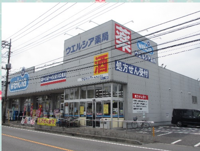
Shop that sells food, medicines, etc. are open 24 hours