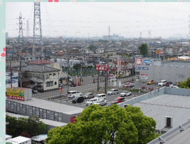
Around Sakura no Sato