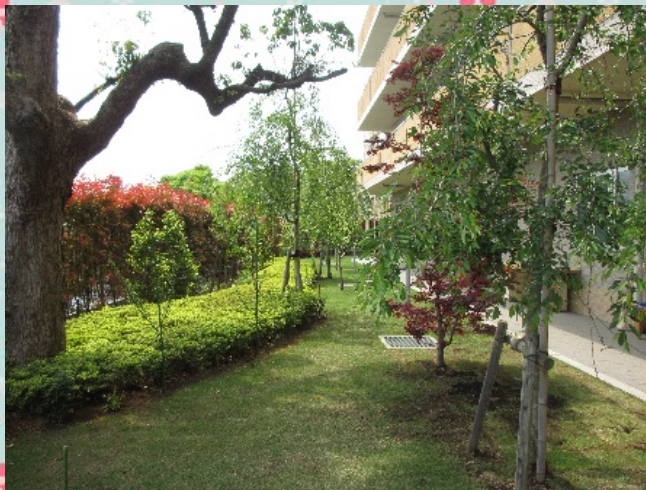
Excellence Awards for the Beauty of the Environment